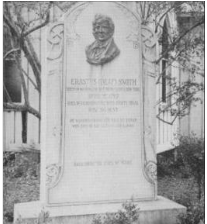
Deaf Smith died in Richmond on Nov. 30, 1837. However, nobody marked his grave and the burial site is still unknown.

Unfortunately, no one at the time thought to mark the grave and the burial site became lost. The general thought around 1900 was that the grave was near the Episcopal Church at what is now the corner of 6th and Houston Streets.