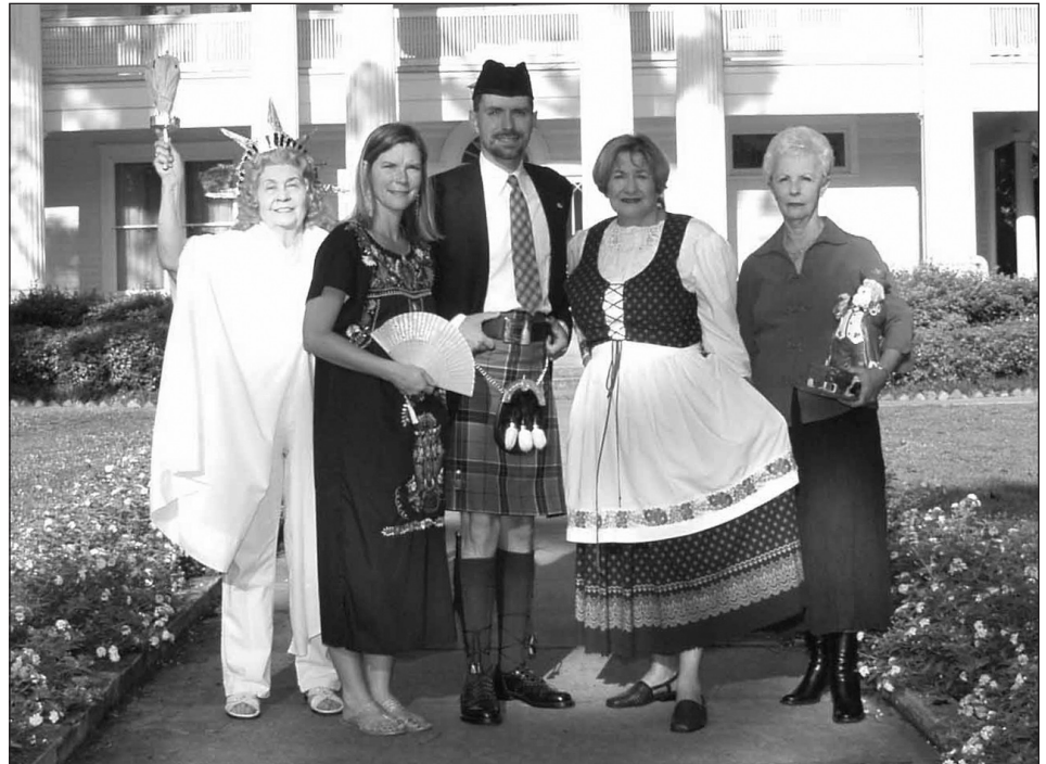
"Christmas Around the World" is the theme for this year's annual Candlelight Tours event.

The Docents are currently selling raffle tickets for a number of prizes, including a double/queen-sized